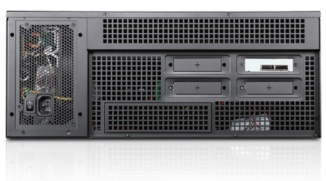
*Centronic bridgeboard and PSU not included

We at iStarUSA Group offer OEM/ODM services for Industrial Power, Custom Power, Chassis, Cabinets, and Data Storage. Through our skilled metal bending, milling, and silk screening we can provide you with unique customizations that will make your product stand out from the rest. With iStarUSA Group's OEM/ODM Solutions you can be sure to receive one-of-a-kind products for your one-of-a-kind business.