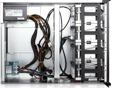
*Centronic bridgeboard, data cables, and PSU not included