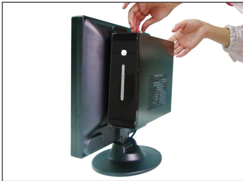
4.tighen the screw upside