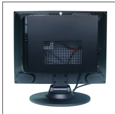
2.The back side