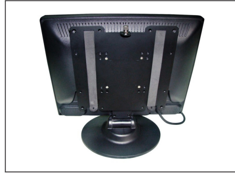
2.installing the bracket into respective holes of LCD monitor