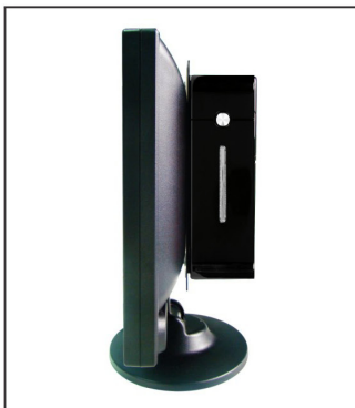
1.The left side