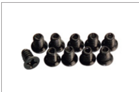
For PC CD-ROM For standary HDD & lid