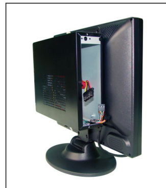
3.The right side