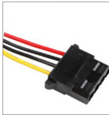
4 PIN (Female Pin)