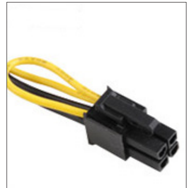
CPU 4 PIN