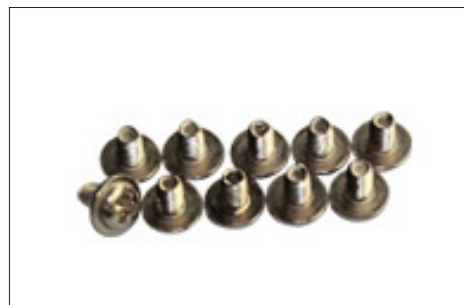
For the PC hard drive and the mainboard