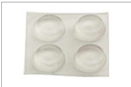
For circular PAWS (horizontal)