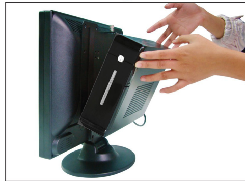
3.tilt the computer case at 45 degree angle