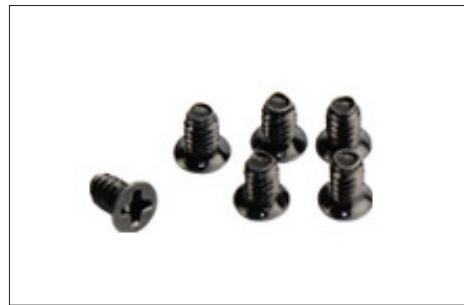
For PC HDD