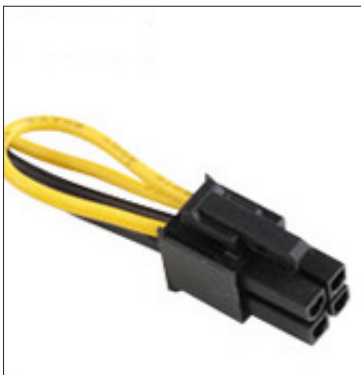
CPU 4 PIN