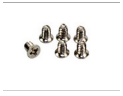
For standard hard drive