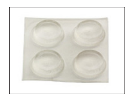
For circular PAWS (horizontal)