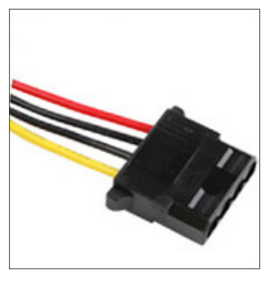
4 PIN (Female Pin)