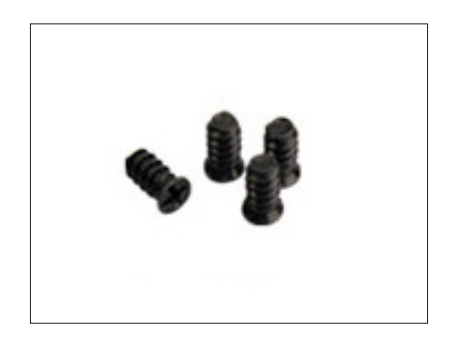
For 8cm fan