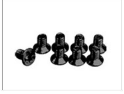
For PC HDD