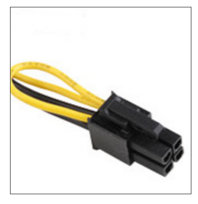
CPU 4 PIN