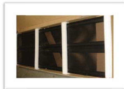
BOX2: 1x Front Door, 2x Rear Door