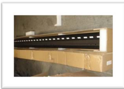
BOX1: 4x Posts, 4x Scale Posts