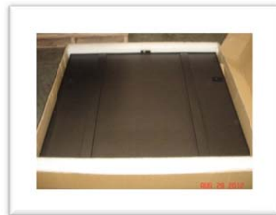
BOX4: 4x Side Panels