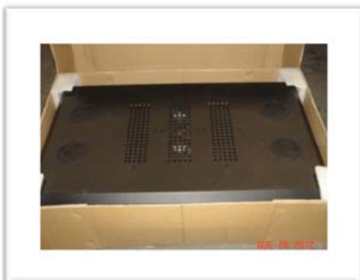
BOX5: 1x Top Cover, 1x Bottom Frame, 2x Frame Bar