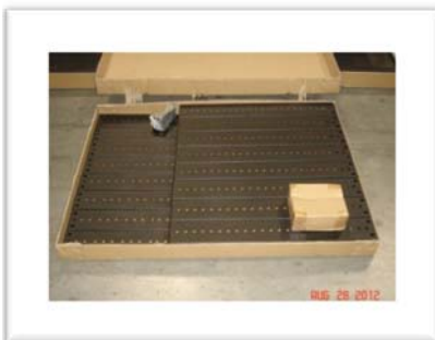
BOX3: 8x Rails, 1x Accessory Box, 4x Pallet Holder