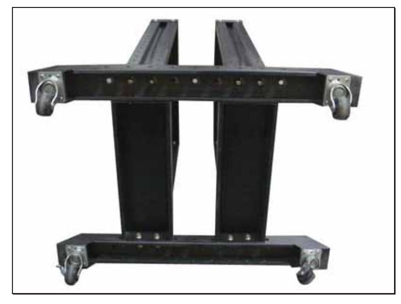
Install the other base