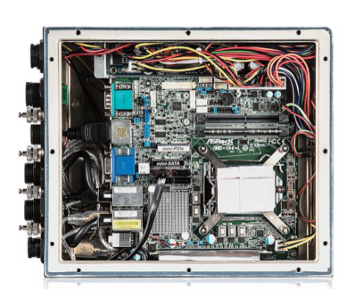
**Motherboard and system components are not included, please contact our sales for system intergration inquiries**