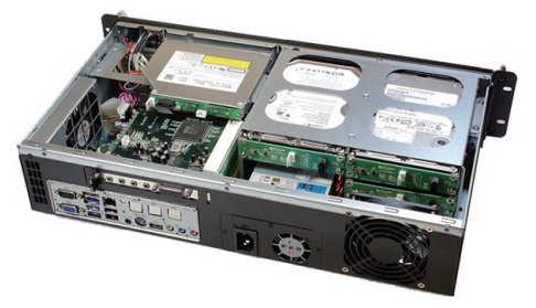
**Motherboard and system components are not included, please contact our sales for system intergration inquiries**

We at iStarUSA Group offer OEM/ODM services for Industrial Power, Custom Power, Chassis, Cabinets, and Data Storage. Through our skilled metal bending, milling, and silk screening we can provide you with unique customizations that will make your product stand out from the rest. With iStarUSA Group's OEM/ODM Solutions you can be sure to receive one-of-a-kind products for your one-of-a-kind business.