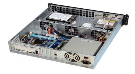
**Motherboard and system components are not included, please contact our sales for system intergration inquiries**

We at iStarUSA Group offer OEM/ODM services for Industrial Power, Custom Power, Chassis, Cabinets, and Data Storage. Through our skilled metal bending, milling, and silk screening we can provide you with unique customizations that will make your product stand out from the rest. With iStarUSA Group's OEM/ODM Solutions you can be sure to receive one-of-a-kind products for your one-of-a-kind business.