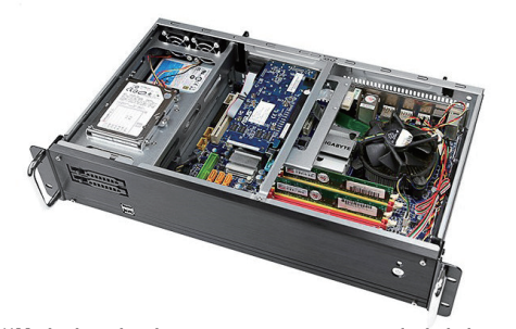
**Motherboard and system components are not included, please contact our sales for system intergration inquiries**