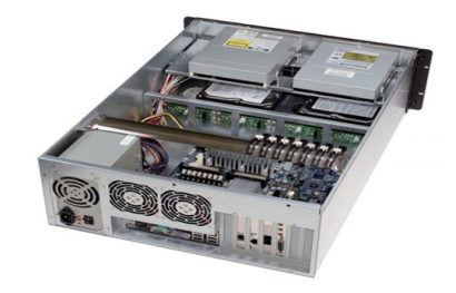
**Motherboard and system components are not included, please contact our sales for system intergration inquiries**

We at iStarUSA Group offer OEM/ODM services for Industrial Power, Custom Power, Chassis, Cabinets, and Data Storage. Through our skilled metal bending, milling, and silk screening we can provide you with unique customizations that will make your product stand out from the rest. With iStarUSA Group's OEM/ODM Solutions you can be sure to receive one-of-a-kind products for your one-of-a-kind business.